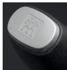
Easy to remember: placement of a logo in the end cap.

This leaflet also includes an interactive DVD containing a portrait of us. You will learn something of our philosophy, our production as well as the products and their professional application.